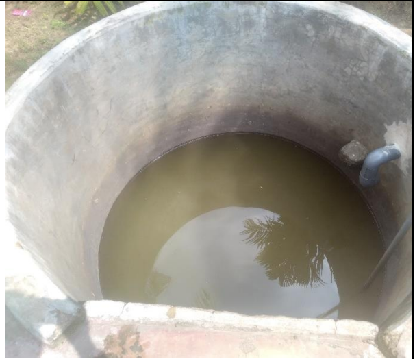
Balasingam Saroja, well and well recharge system