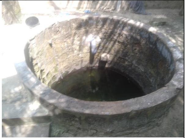
Sivarsa Balrasa , well and well recharge system