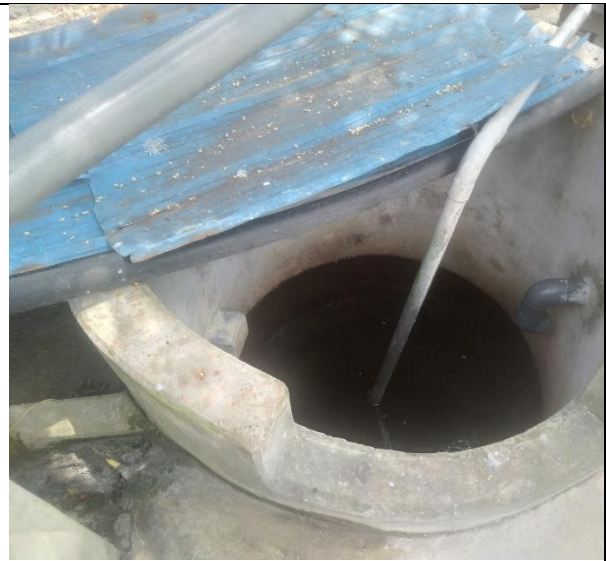
Thankaveluitham Kugarasa well and well recharge system