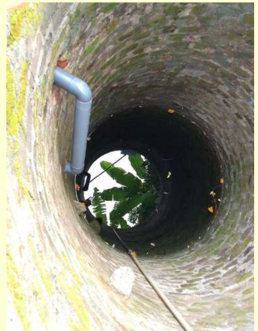
වැසි ජලය මගින් ළිං ආරෝපණය කිරීම